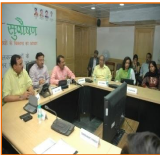
Press conference by all partners announcing launch of the programme