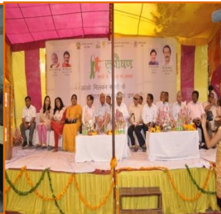
Inaugural event: Participation by partners, stakeholders, parents, children, school authorities.