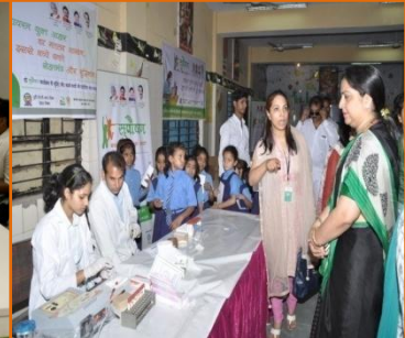
Screening drives at school supervised by advisors