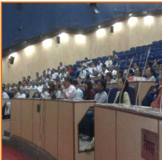
Teacher and principal education workshop