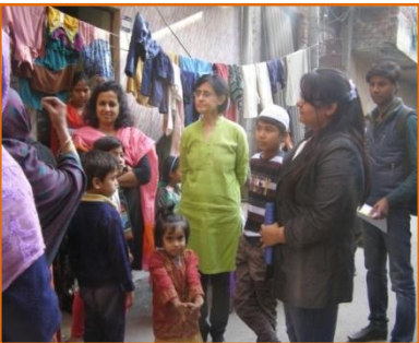
Home to home interactions in different parts of the city