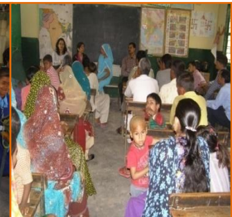
Parent interaction sessions at schools