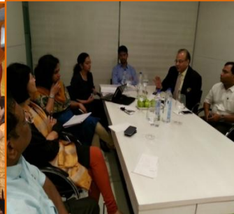
Advisory board meetings to fine tune the project