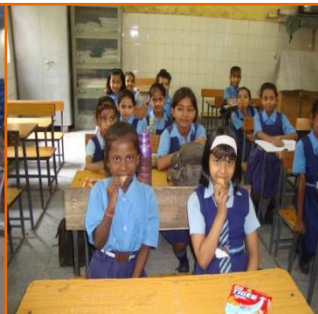
Children enjoying eating fortified biscuits